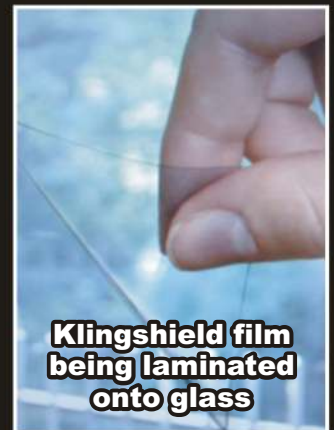
Klingshield film being laminated onto glass

KLINGSHIELD EST. 1970 FOR EXTERIOR WINDOW PROTECTION