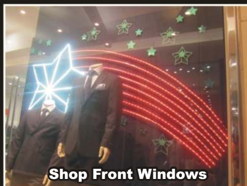
Shop Front Windows