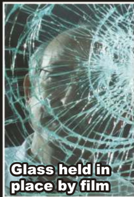
Glass held in place by film