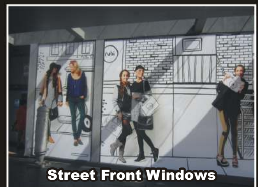
Street Front Windows