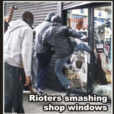
Rioters smashing shop windows