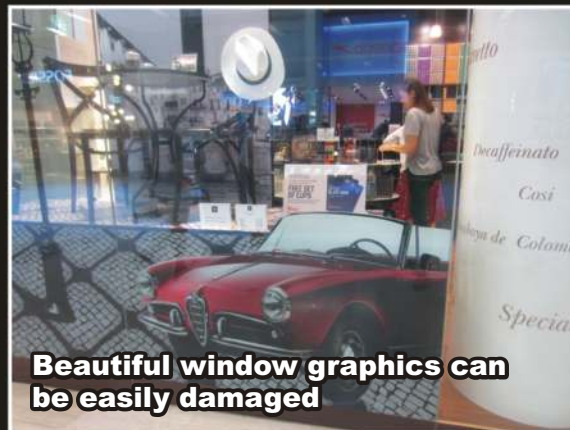
Beautiful window graphics can be easily damaged