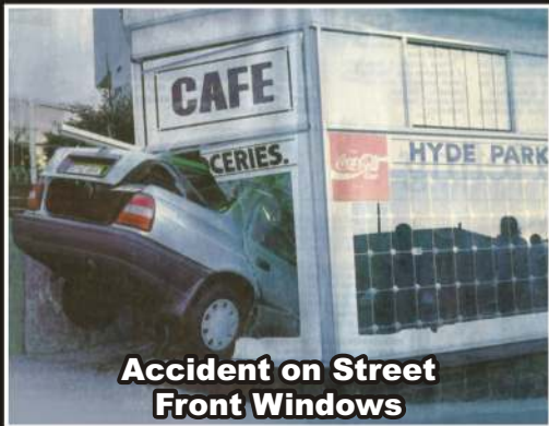
Accident on Street Front Windows