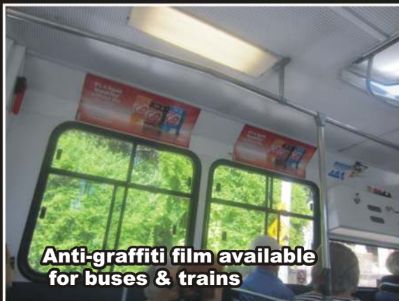
Anti-graffiti film available for buses & trains