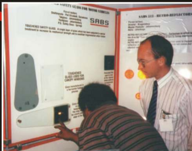
Klingshield personnel in discussion with SABS member