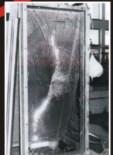
Report no. 0611/8684/78 Treated glass pane after impact glass fragments adhere to the plastic film holding the glass in place